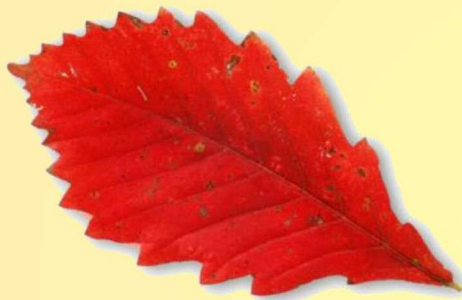
Swamp Chestnut Oak

Chlorophyll is responsible for helping trees and plants turn sunlight into food. For most months, it is the dominant colour seen in most leaves until it fades away. As many trees shut down their food production, they turn to stored sugars to survive the winter.